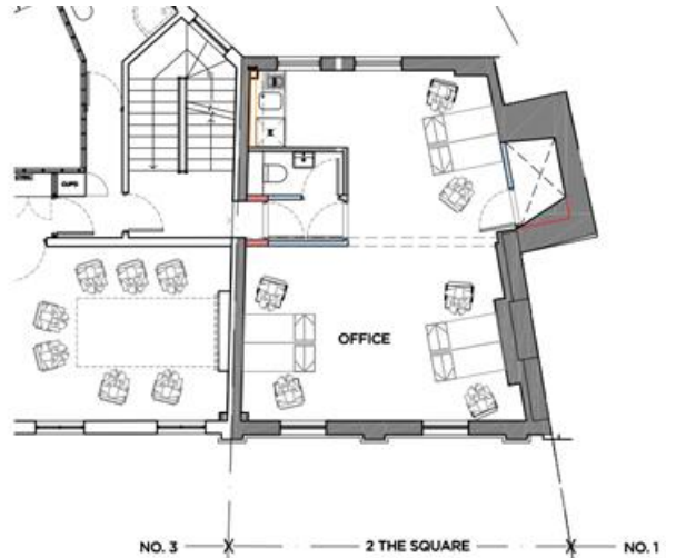
SECOND FLOOR PLAN 1:100