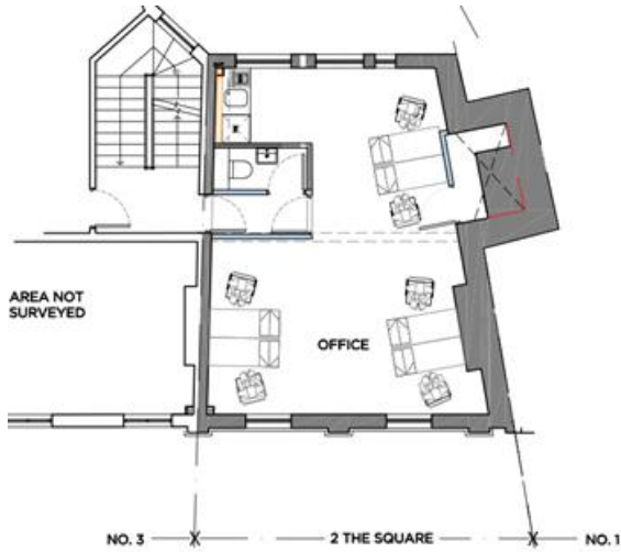
FIRST FLOOR PLAN 1:100